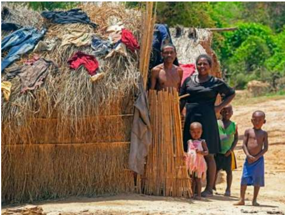
Poverty is abundant

The average income per capita in Madagascar is $545.00 per year—not week, not month—but year! This is ultimate poverty and Madagascar unfortunately almost always ranks in the top five poorest nations. In Madagascar approximately 75% of its population are living in extreme poverty, heavily impacting rural areas where 80% struggle to survive. The situation is driven by low-productivity subsistence agriculture, high vulnerability to cyclones, political instability, and corruption. Key effects include severe child malnutrition (39.8% stunting), low school attendance, and a lack of basic infrastructure (according to the World Bank).