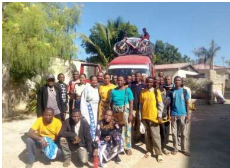
A group of evangelists