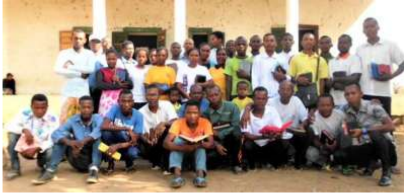
Students at Mananovy Bible School

In addition to these seminaries, there are approximately 24 Bible schools —roughly one for each synod—that offer two-year programs to train laypersons as evangelists. The evangelists typically are assigned to live in a village where there are a few or no Christians. It may be a difficult situation and in some cases the evangelists may need to be removed because of physical threats, but these evangelists are at the center of the rapid growth of the Malagasy Lutheran Church.