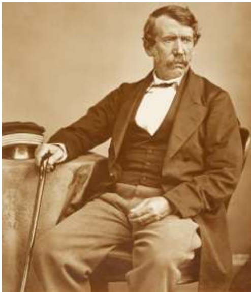
David Livingstone, 1864