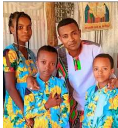
An evangelist and his family

Villages visited: 999 Families visited: 3,728 Baptism of children: 967 Baptism of adults: 496