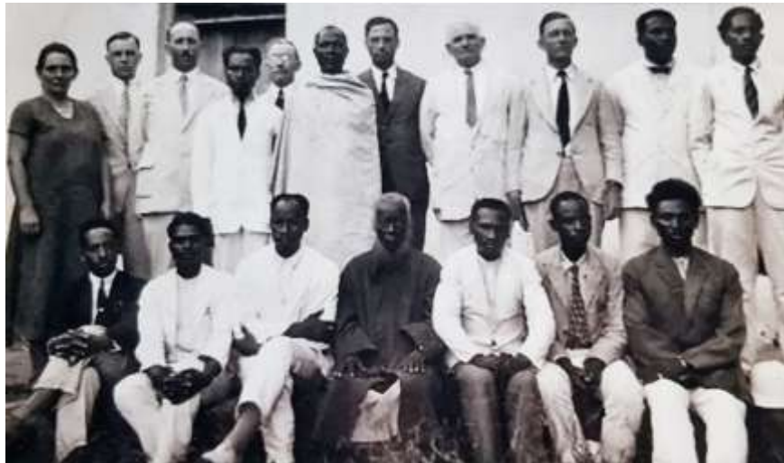
Early Malagasy Christians