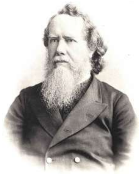
J. Hudson Taylor, 1893 [public domain]

They all faced all the dangers of being early missionaries in a foreign land, culture and language, but with a faith to move mountains!