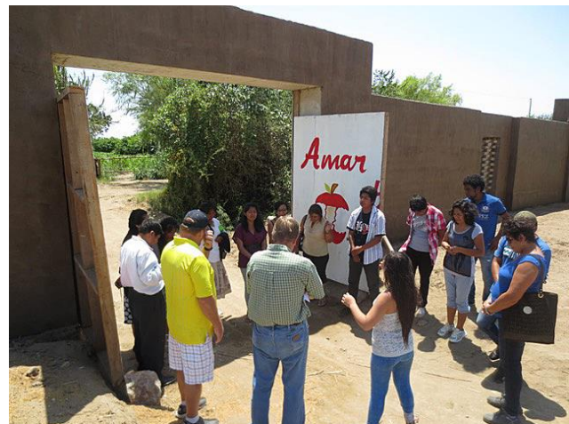
People praying at the gate at the 2016 inauguration

We arrived in La Paz and began fasting, praying and dreaming. We spent nights awake, talking as we dreamed. Through the years we had gathered a following of university students that called themselves Go Missionaries. They gathered to pray every Friday evening and stayed until everyone fell asleep. In the morning, all got up and went off to the University or to work. We told them what we thought the Lord was speaking to us and asked them to pray.