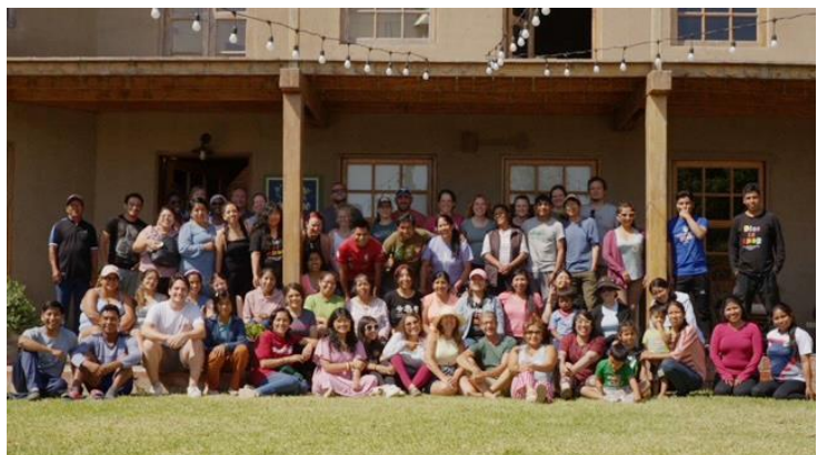
USA, Peru, Bolivia & Switzerland at 15-year anniversary

The vision is far from complete, but it's established. This January we came together from the U.S., Switzerland, Bolivia and Peru in Celebration. This is what God does: He puts a dream in your heart and then in faith He calls you to the Believable .