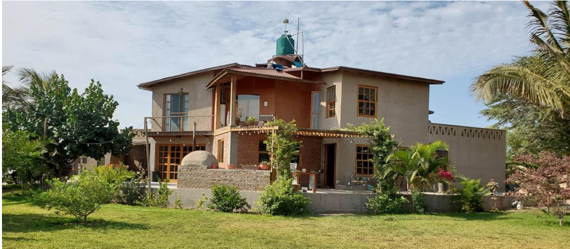
The Potters House Ministry Center