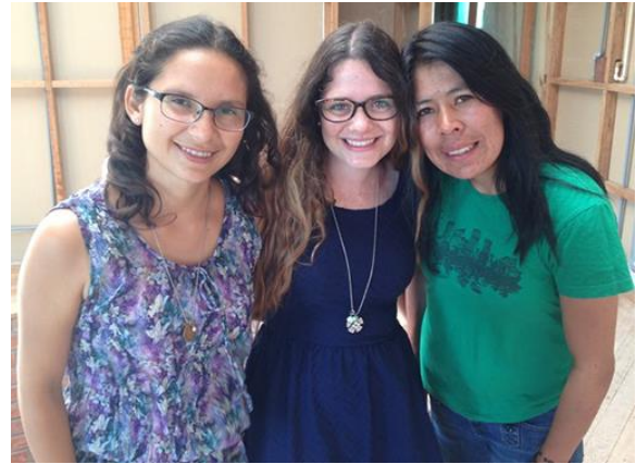
My three worlds: Peru, USA, Bolivia

Plenty of other activities take place throughout the year, providing options to invite those who might not be comfortable going to church, but who are willing to try Jesus through this third-party connection. We also serve the Church through active exercises of praise, through massage and spiritual counseling.