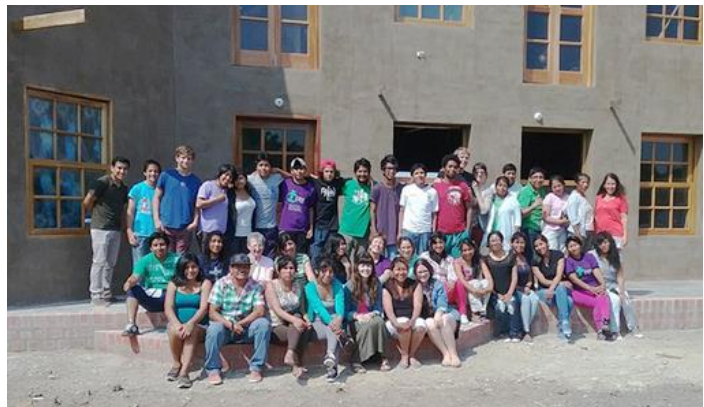
Go Missions International Bolivians and Peruvians and Americans all together to celebrate in 2016