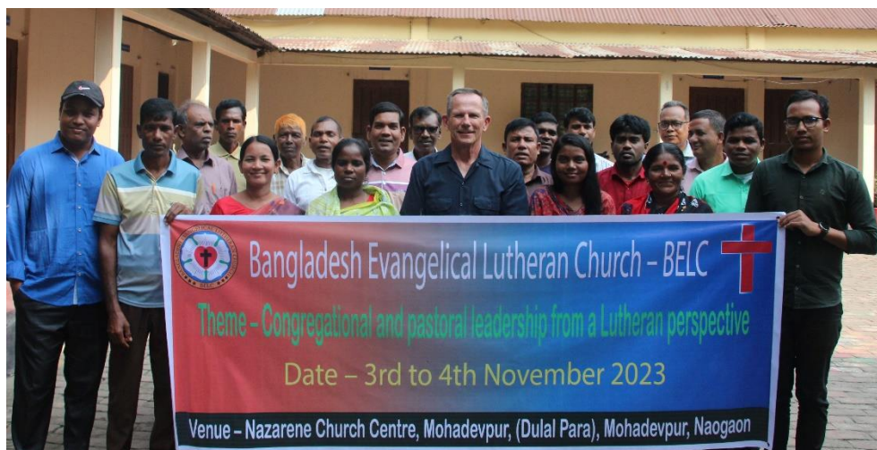
Leadership Training in Bangladesh, November 2023