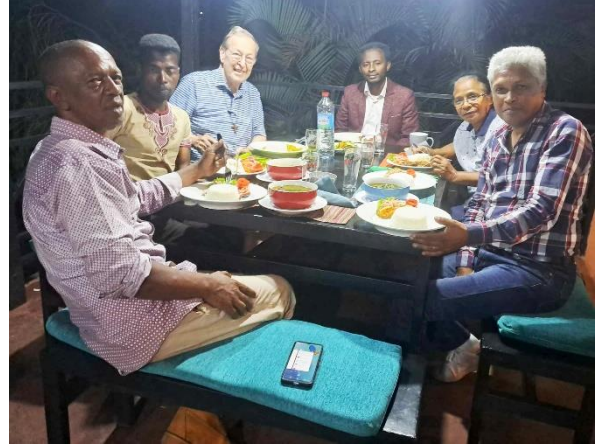
A delicious Malagasy meal with FOMM's Madagascar staff at the end of a busy workday