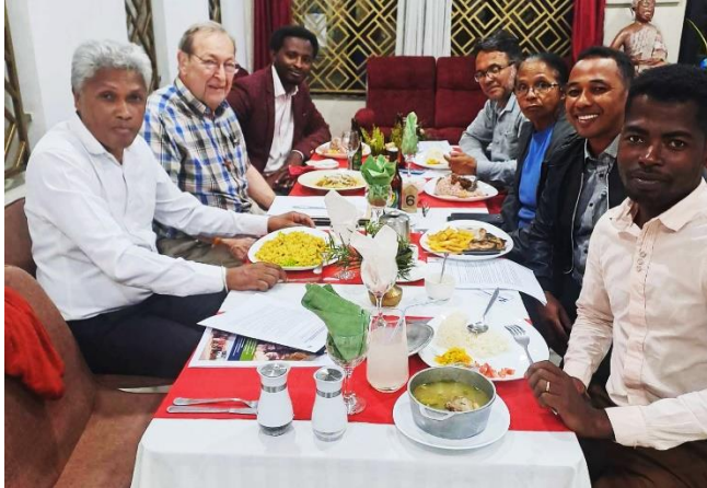
A dinner meeting with representatives from Madagascar Water, who will be drilling deep wells for FOMM