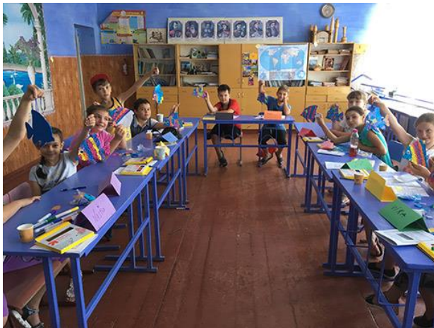
English Bible Camp in Ukraine