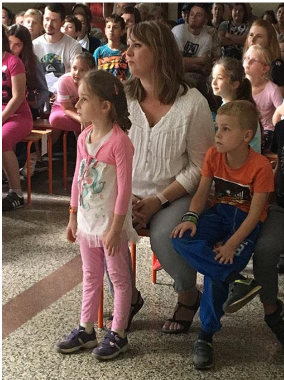
English Bible Camp in Slovakia

At the core of our mission lies the belief that forging international partnerships strengthens relationships, nurtures disciples, and equips the Body of Christ for Kingdom Building. This is a journey of profound impact and transformation, grounded in faith and driven by purpose. It has been our privilege to be able to serve in this way for the last 31+ years, and we are committed to stewarding this ministry into the next generation and beyond.