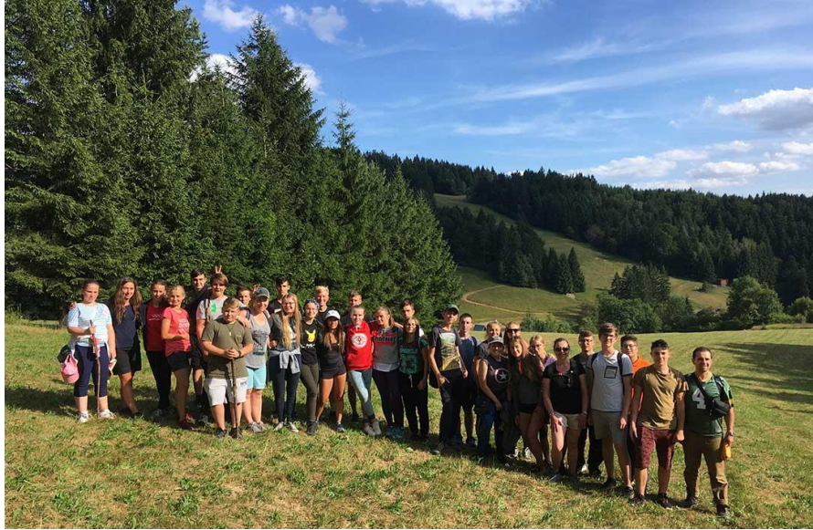
Life & Adventure Camp hike