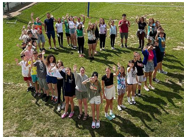
2023 Life & Adventure Camp in Slovakia