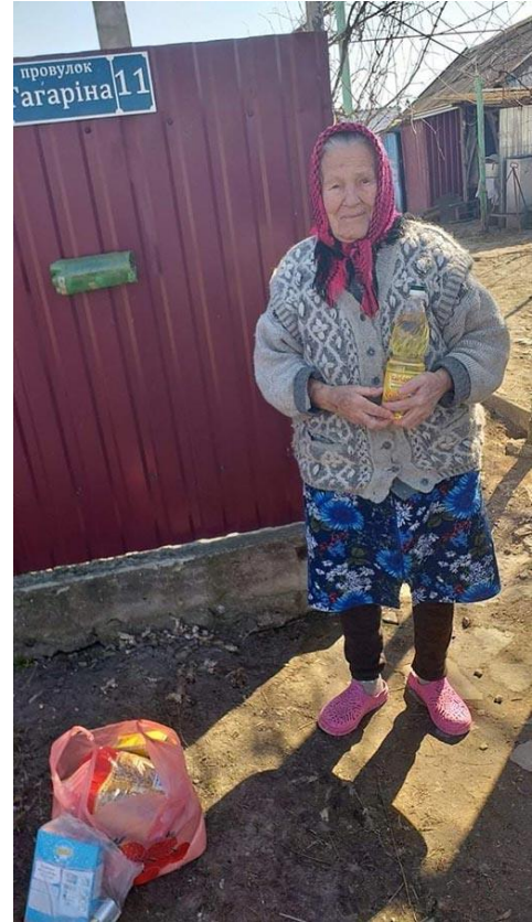
Babushka receiving food from SON Ukraine Relief Fund