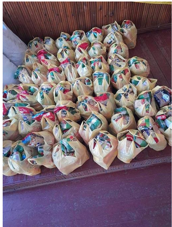
Christmas food packages for Ukrainian families