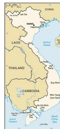
Map of Vietnam