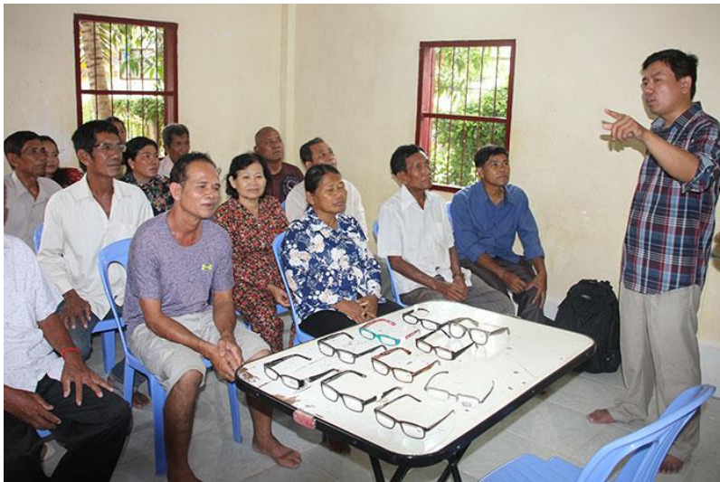
Cambodians learning about reading glasses