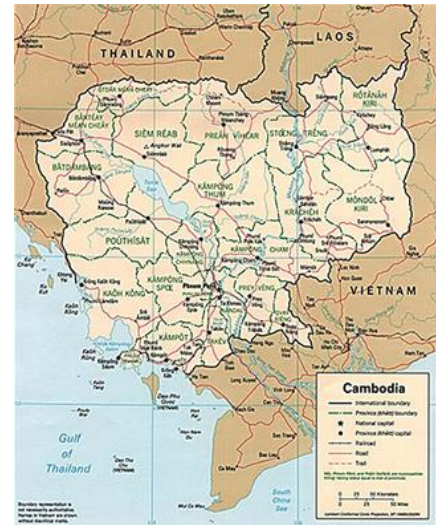
Map of Cambodia