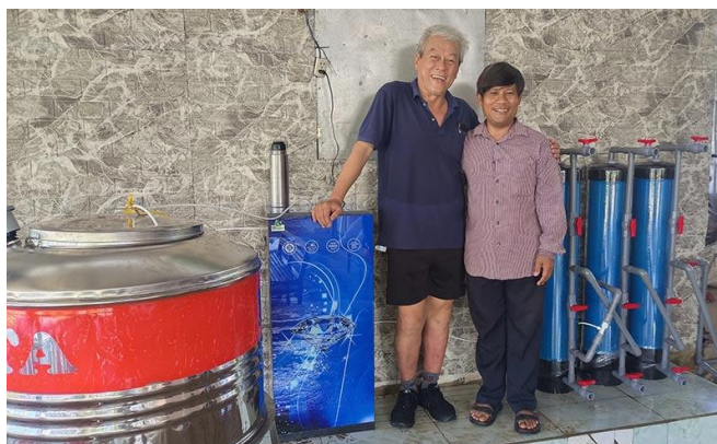
Water filtration system in Vietnam

At ALWM, our relief efforts – schools, wells, medical care and more – are always in cooperation with local churches and their leaders, who are at work through the year preaching the Gospel and making disciples! It’s the first question we ask as we weigh invitations to partner in new countries (now nine on four continents!).