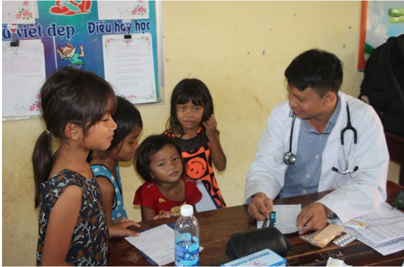
Outreach Vietnam: Doctor talks with 4 girls in his office