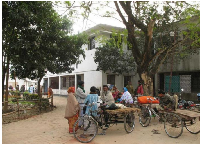
WMPL hospital in Bangladesh

So front line humanitarian work done in Jesus’ name has opened doors also to the preaching of the Gospel!