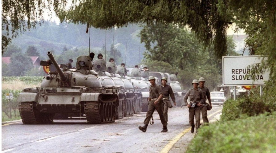
Slovenia independence, 1991