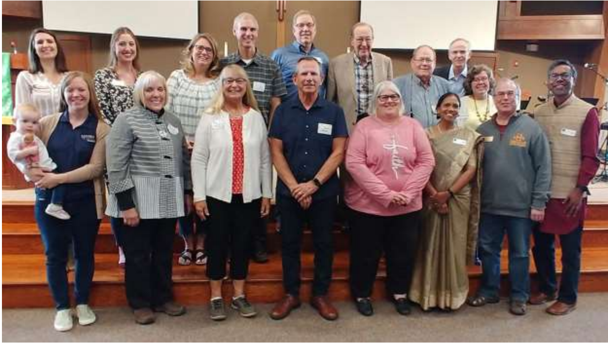
Some of the Conference participants